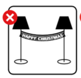
Decorations can burn easily – so don't attach them to lights or heaters.