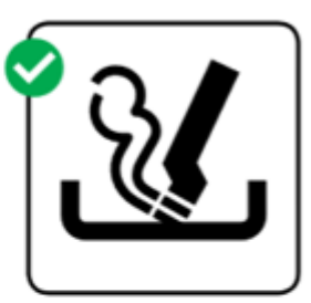
Make sure cigarettes are put out properly.