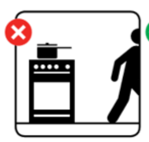
Most fires start in the kitchen. Avoid leaving a cooker unattended. Avoid cooking when under the influence of alcohol.