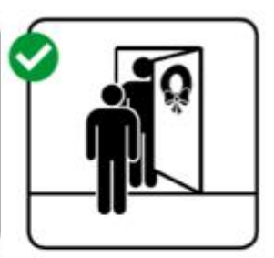
Take time to check on older relatives and neighbours this Christmas as they are at greater risk from fire.